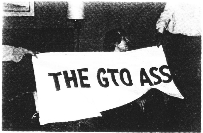
I've been called worse.