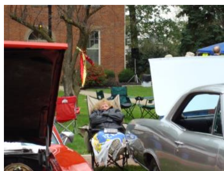
At least Kim won't get sunburned today!