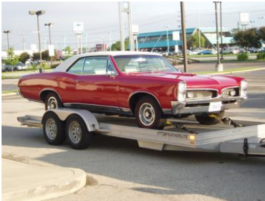
Jim's car is FINALLY together and it's a GREAT ONE! ;)

More pictures and the results are posted on the club's website. The next couple pages have the results for the classes that had entrants. Thanks to all that came early and stayed late to help setup and tear down for a great time and a successful show!