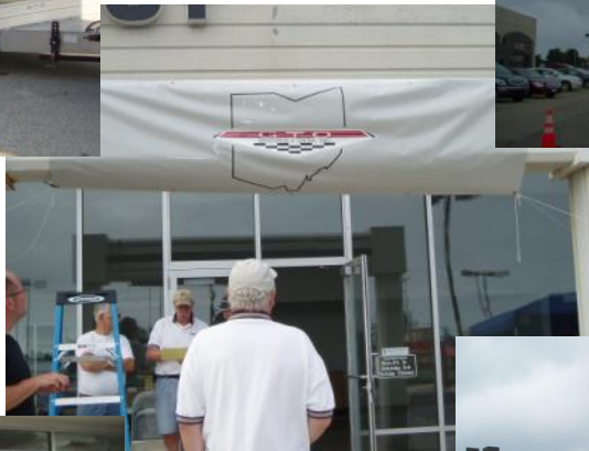
Hey! We got the sign up