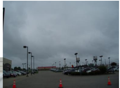
Please, please don't rain!