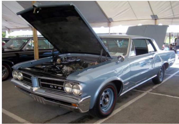
Ron Cozzo: 1st Place Class ST2 64-65 Street Modified GTO

So the pictures are the pictures from the Co-Vention, but they were the same cars and same owners. Congratulations! More Norwalk pictures next month.