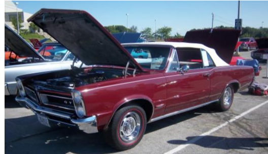
Jim Evans: 2nd Place Popular Vote 65 Conv. Stock