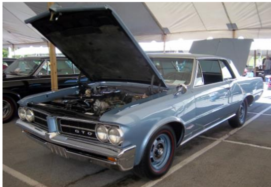
Ron Cozzo: Gold GTOAA Concourse and POCl Points 64 Modified