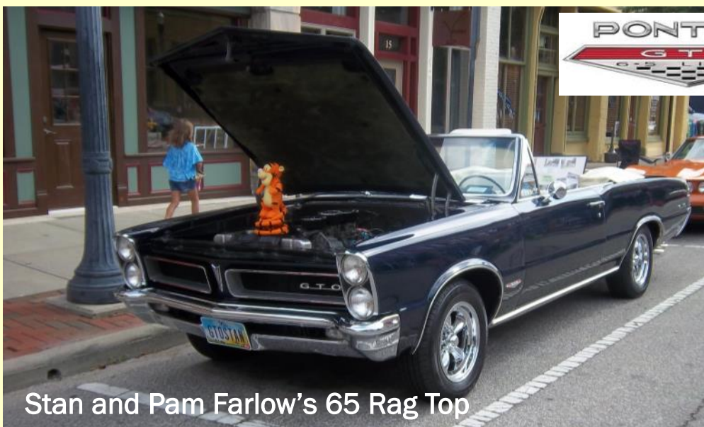
Stan and Pam Farlow's 65 Rag Top