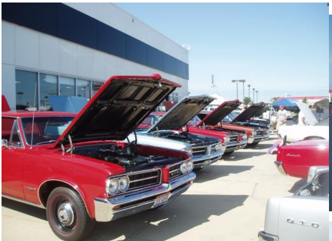
14 1964 GTOs showed up to party!!