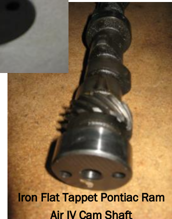
Iron Flat Tappet Pontiac Ram Air IV Cam Shaft