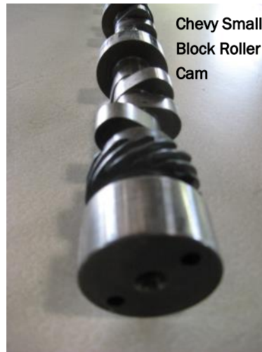
Chevy Small Block Roller Cam

A roller camshaft is a fine upgrade for a performance engine. However now that some of the camshaft manufactures have come out with steel roller cams that use an iron gear to drive the distributor, this is the only way to go for street use. Then you can use your original distributor and the original distributor drive gear with stock reliability.