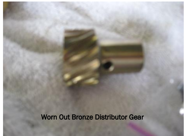
Worn Out Bronze Distributor Gear