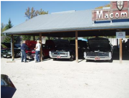
Colo's Classic Car Show Sunday