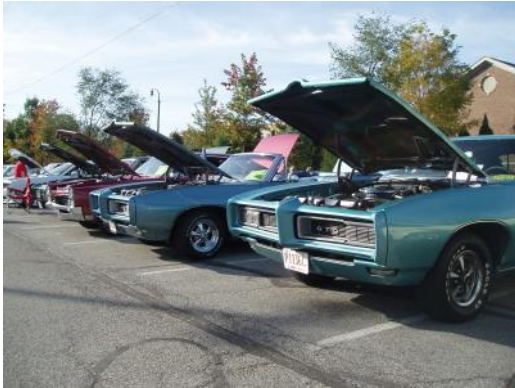
Mac Tools Saturday Cruise-In

It was such a beautiful day Sunday, that a few of us then headed over to Westerville Community United Church of Christ' s Cruise-In and Chilli Cook-off!