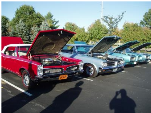
WCUCC Cruise-In & Chili Cook Off