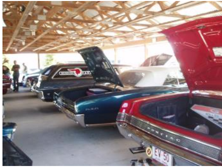
Colo's Classic Car Show Sunday