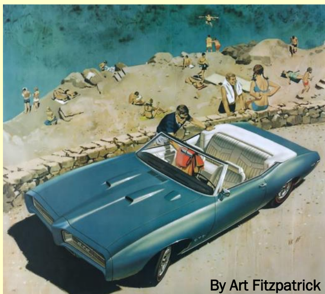
By Art Fitzpatrick