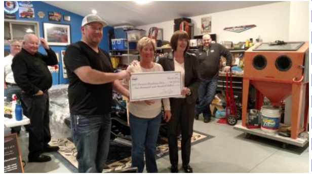
A BIG Check for Prevent Blindness!