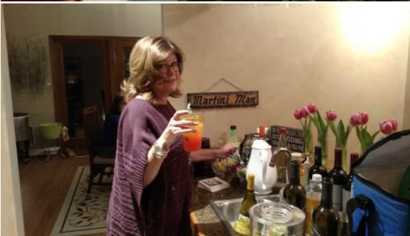
Our wonderful Hostess