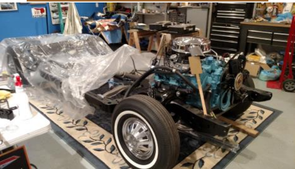
Soon to be a GREAT ONE!!