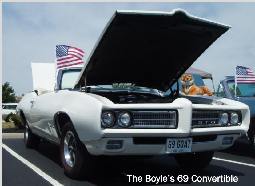
The Boyle's 69 Convertible