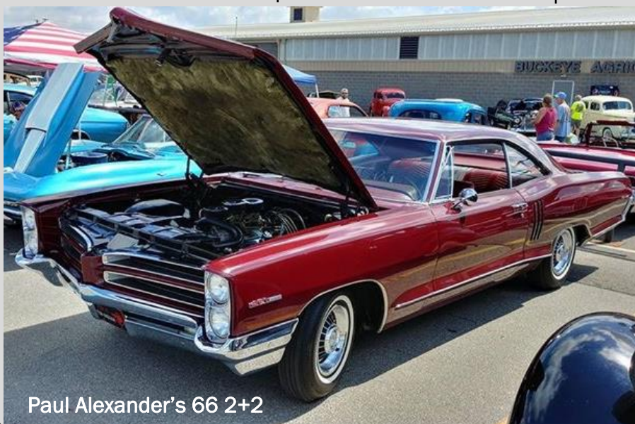
Paul Alexander's 66 2+2