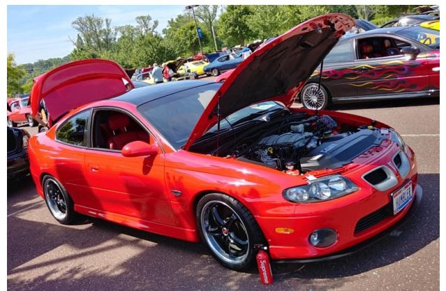
3rd Place Popular Vote Lance Hudnell