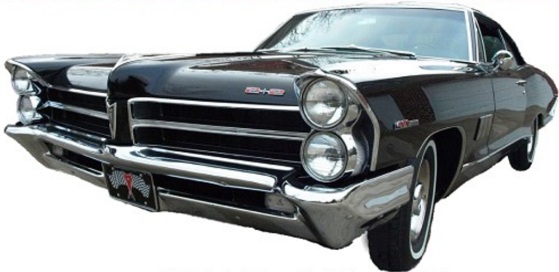
2017 Best of Show - Kevin Haines 1965 2+2

This show is points judged with 13 All Pontiac Classes. Pontiacs or Oakland Vehicles only please. Additional registration information on reverse side.