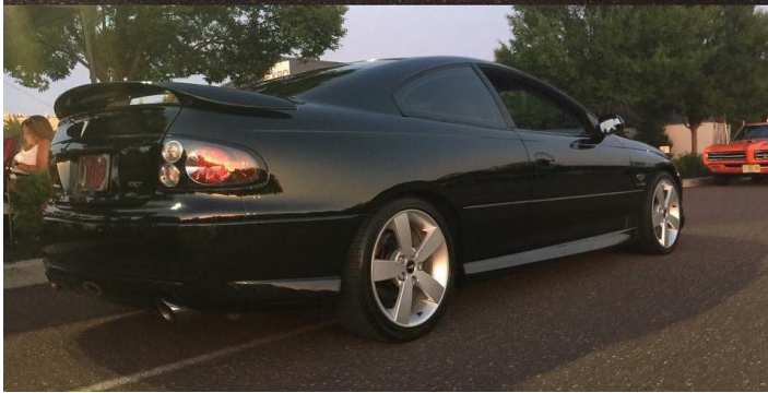
04-06 Popular Vote Best of Show Brian D'Amico