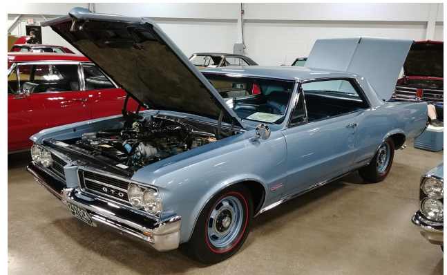
Concourse Best Modified Ron Cozzo