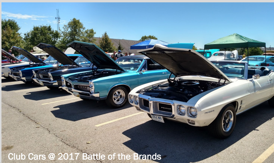
Club Cars @ 2017 Battle of the Brands