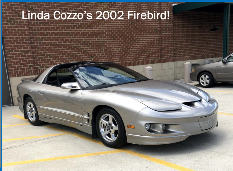
Linda Cozzo's 2002 Firebird!