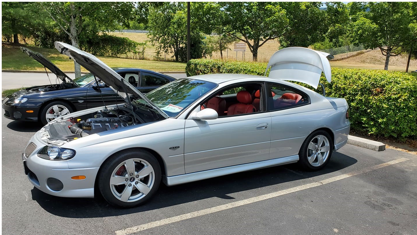
Picture top: Bill and Karen Sigg - Popular Vote Stock 1st Place 2006 GTO