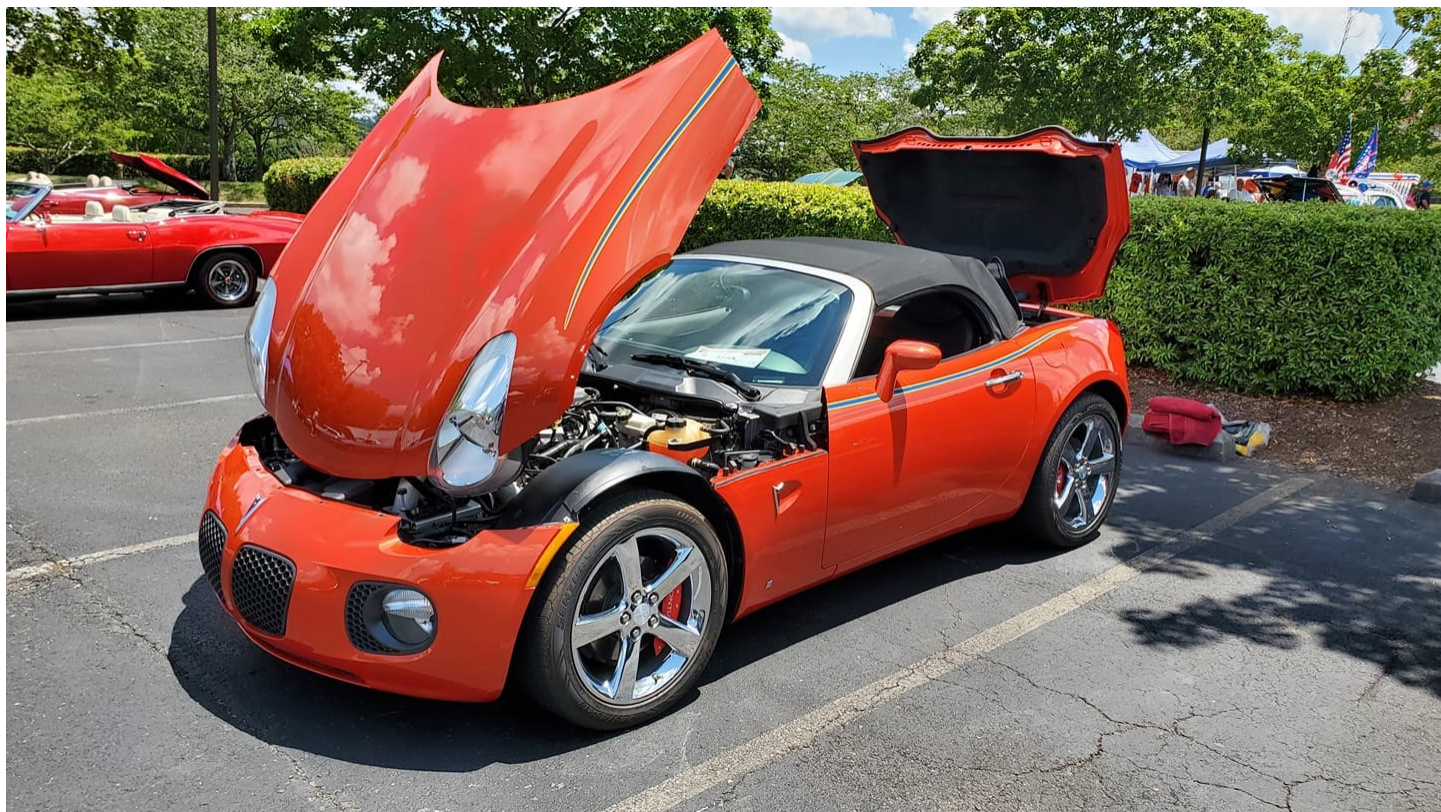
Picture bottom: Lonnie McLaughlin - Popular Vote Modified Other Pontiac 3rd Place 2008 Solstice