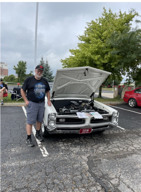
Original owner 1966 GTO Now and then

The day started with a lot of rain and we had approximately 25 cars registered and although we had rain until about 9:00 it kept most entrants away. The rain came back around 10:30 but went away for a sunny afternoon for award presentation.